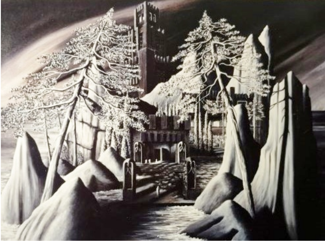
"The Convent of Forgotten Souls" black and white acrylic on canvas, 50" X 60"

In September, 2022, I spent the month living and painting at the Chateau Orquevaux Artists Residency in Orquevaux, France. It was an exceptional opportunity to live and work with fourteen other artists in a splendid chateau on an enchanted estate. What I learned about myself and my work became a clear understanding of where I am in life. My last act. What and how to best use my time in the studio is now paramount. As I have always painted in series of works, my approach will be the same.