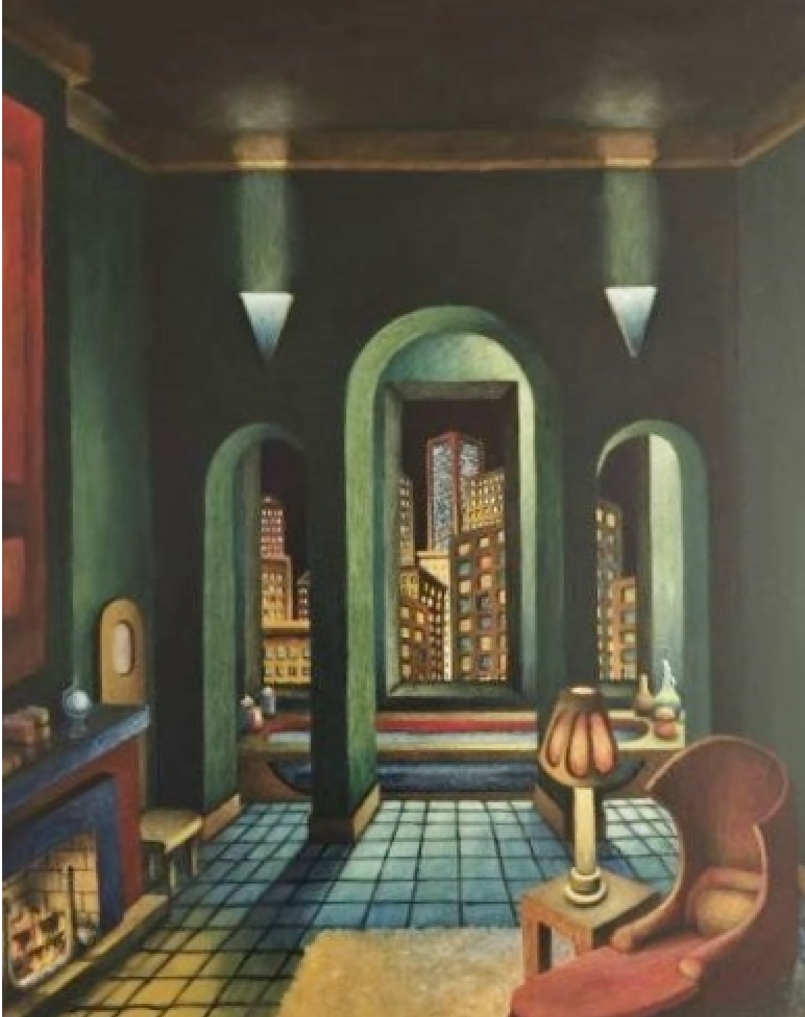
"The Master Bath" (from The Apartment series) acrylic on canvas, 14" X 11"