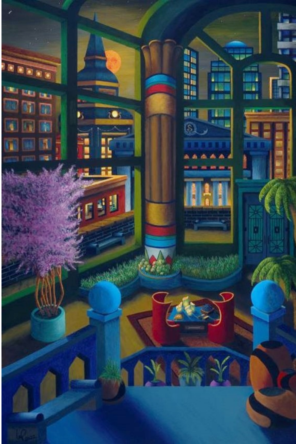
"The Conservatory" (room #8 from The Apartment series) acrylic on canvas, 36" X 34"