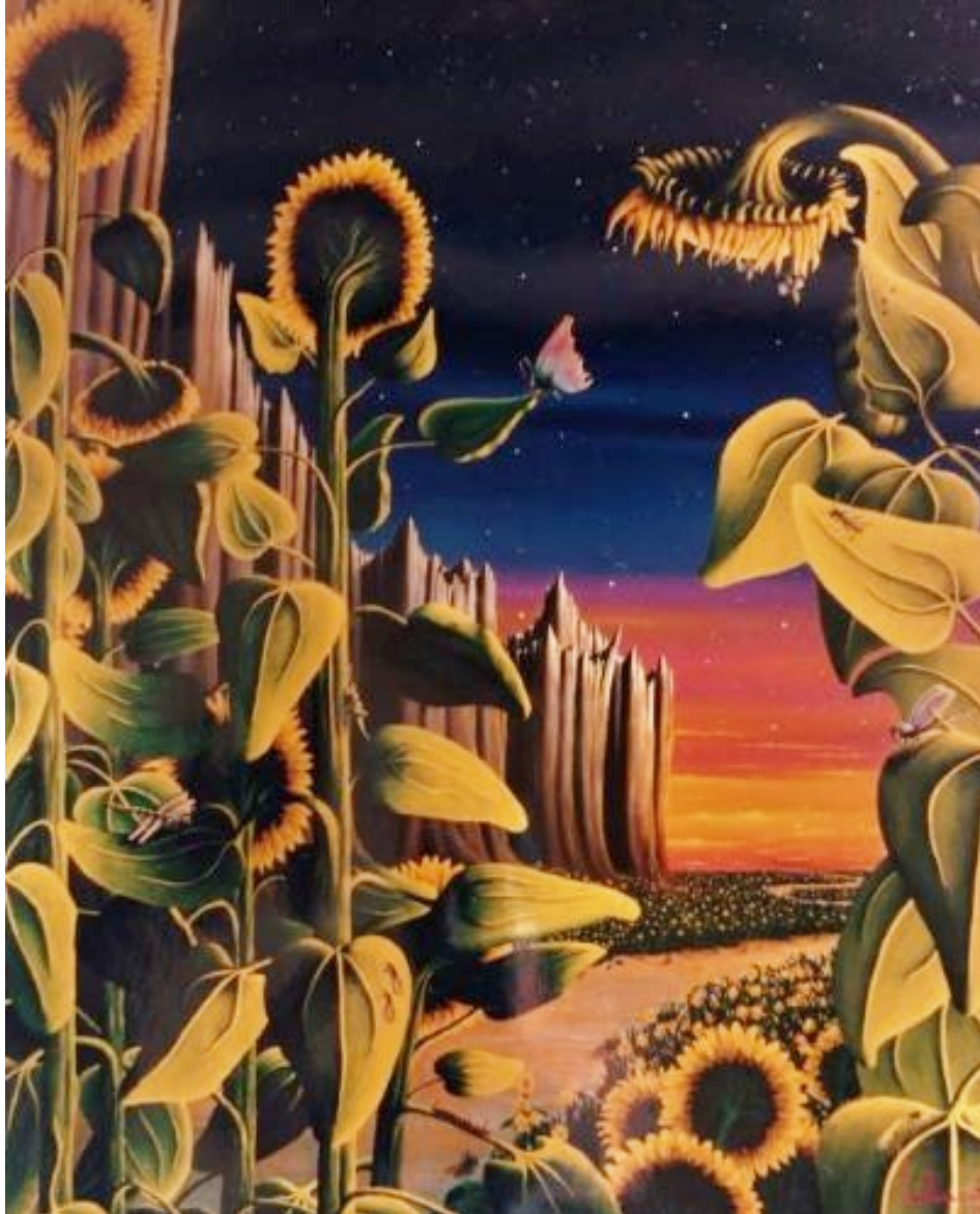
"At The End of the Wall" acrylic on canvas, 60" x 48"

My newest series, which I am calling l'immeuble (The Apartment Building), will be comprised of ten paintings which allow the viewer an opportunity to peer into the lives of others through great and small windows at various times of day and night. I continue to continue. I hope to die with a paintbrush in my hand, but until that time, my intention is to do what I have always done, to work and produce the best paintings I am capable of making.