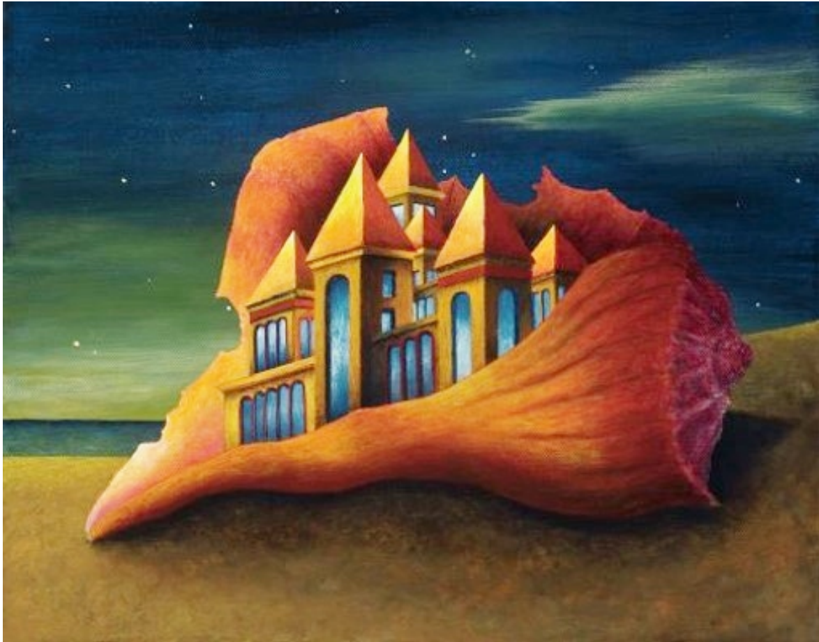
"Shell House" acrylic on canvas, 9" x 12"