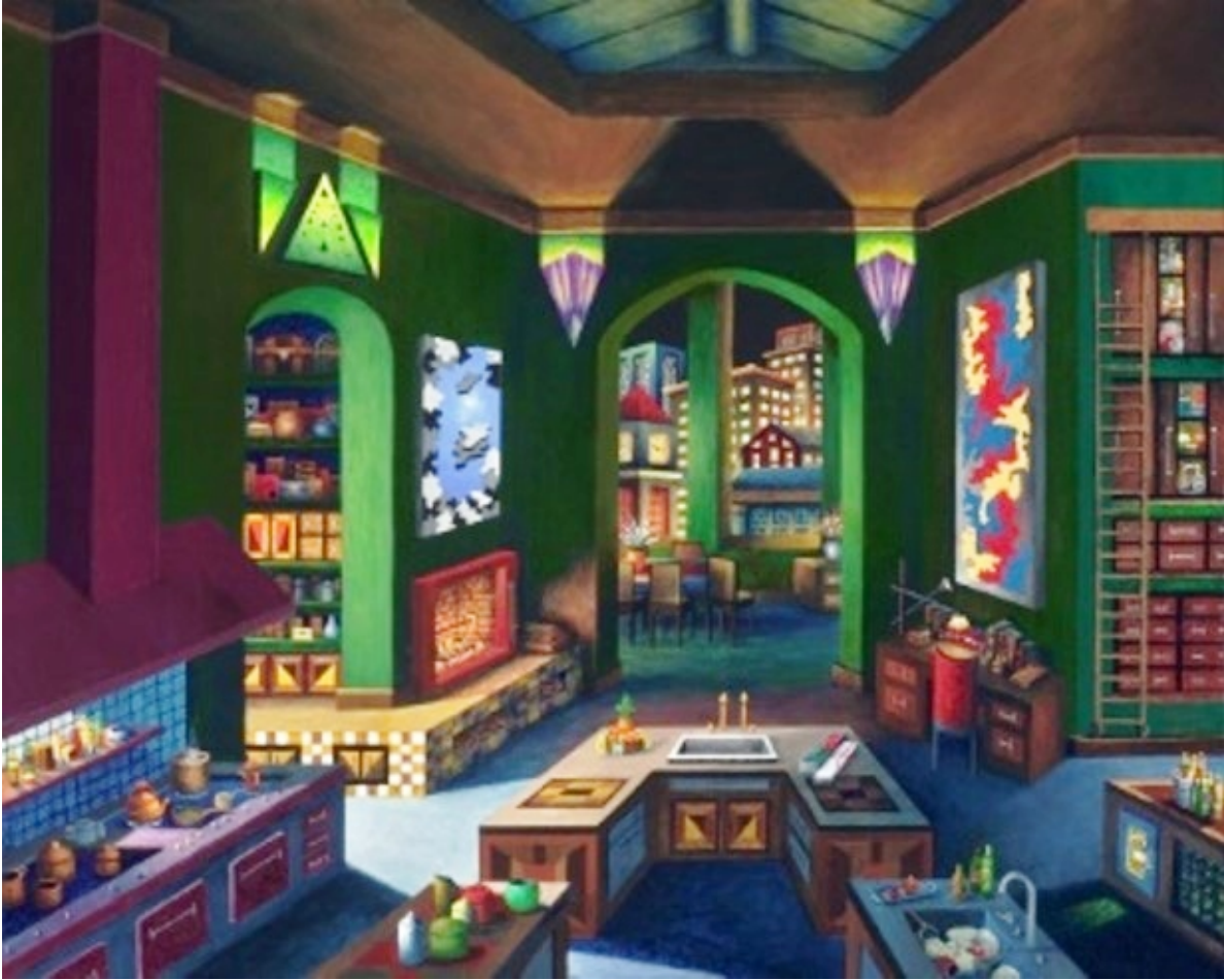
"The Kitchen" (room # 7 from The Apartment series) acrylic on canvas, 32" x 38"

In time I developed my technique and worked diligently to improve with each new painting. There are intentional mysteries in my work and many questions. I purposely paint my perspectives slightly askew to create movement and a feeling of dimension. My palette is made up of earth tones mixed with Prussian Blue, my favorite color in the world, and reds.