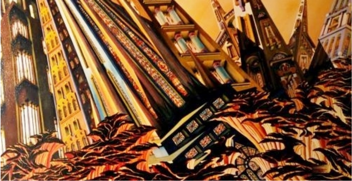
"The Fall of Purgatory" a.k.a. "Ingress" acrylic on canvas, 64" X 103"

I have the extraordinary gift of being able to paint anything I choose without having concern of selling, egos or ugly comments. I paint every day of the week for at least seven hours, longer when I was young. During that time, I live the story the painting is telling with musical soundtracks, of my own creation, fueling my desire to paint.